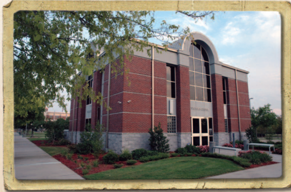
HATTIESBURG VISITORS CENTER

- FANNIE LOU HAMER FREEDOM SUMMER ORGANIZER AND CIVIL RIGHTS ACTIVIST