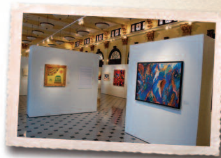
Breaking the Veils International Art Exhibit on display at Hattiesburg's Historic Train Depot during Fall 2008.

For more information about the Mississippi Tourism Association, visit mstourism.com . 597842