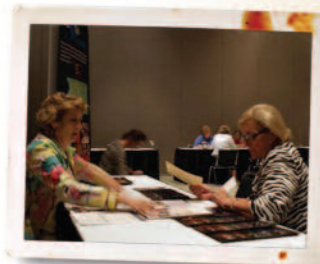
Delegates participate in "Speed Dating" at the MSAE Mid-Year Conference.