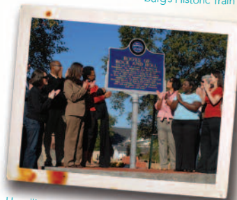
Unveiling ceremony of the Blues Trail marker on Historic Mobile Street, a project of VISITHATTIESBURG™.