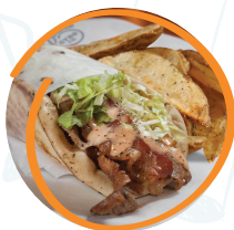
GLORY BOUND GYRO CO. Comeback Gyro