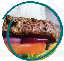
SOUTH MOUTH DELI Impossible Burger