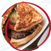
FAIRLEY'S WINGS AND MORE The Spanky