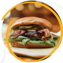
BRASS HAT AT HOTEL INDIGO Brass Hat Burger