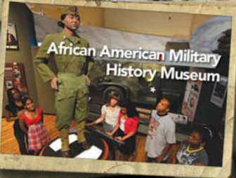
African American Military History Museum