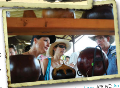
TOP: Choctaws demonstrate a native dance. ABOVE: An artisan explains the craft behind his wood bowls to a pair of shoppers. BELOW: Visitors look through homemade wares in the Grand Hall including soaps, candles and potpourri.