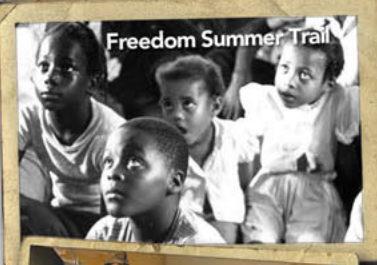
Freedom Summer Trail