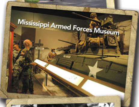
Mississippi Armed Forces Museum