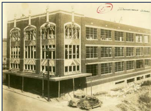
DAVIDSON BUILDING, CIRCA 1929

By 1920, Hattiesburg had become Mississippi's fourth largest city. The area's prosperity led to the creation of Forrest County in 1908 with Hattiesburg serving